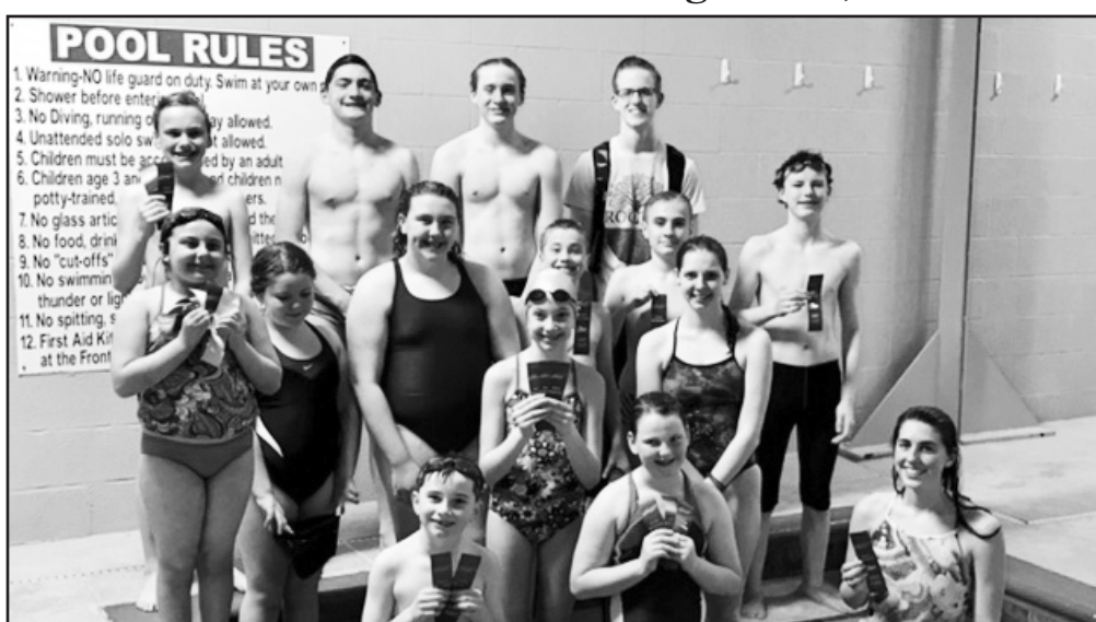
North Georgia Rapids Swim Team

The local swim club, North Georgia Rapids, ventured north to Highlands, NC to represent their club in the annual "Swim Above the Clouds" meet. The team was very successful with many personal best times and pool records: